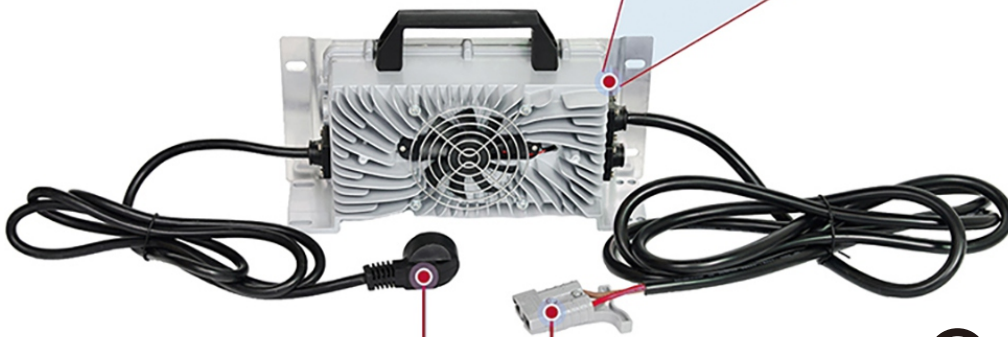
② AC input connector