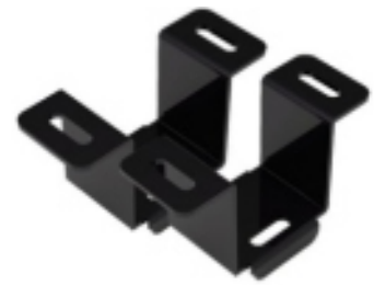
③ Adaptive Brackets