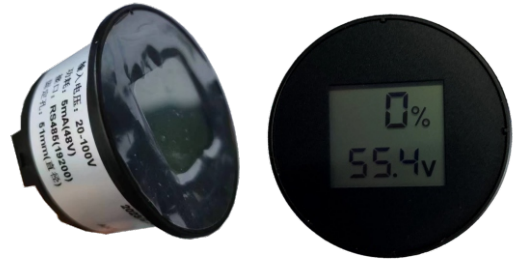
② Battery Gauge