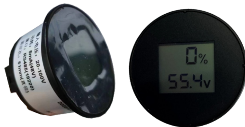
② Battery Gauge